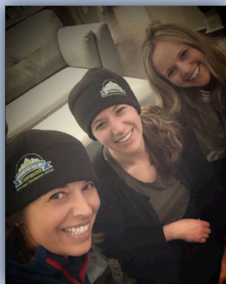
3 Bike Moms get top honors in the all female team division.